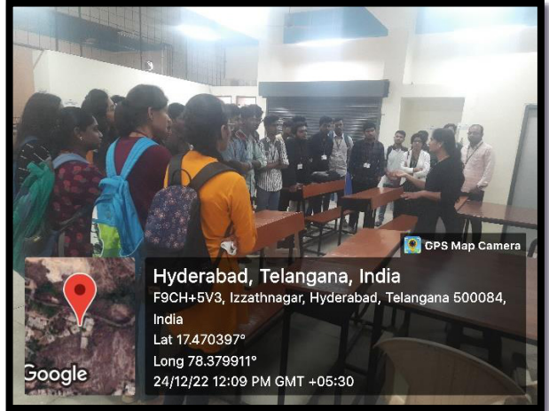
Few snapshots during the industrial visit